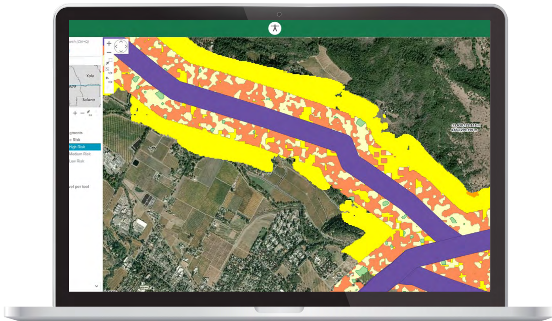
A Java-based rich client app provides GIS capabilities on the web.

Future-proofing and environment tuning of your platform.